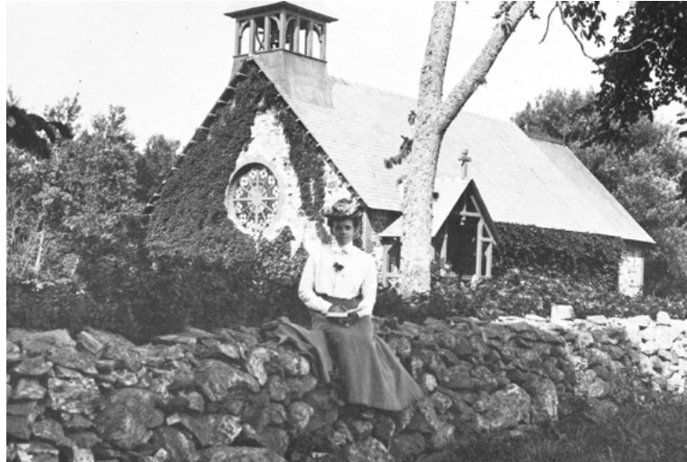
Unknown parishioner circa 1905.